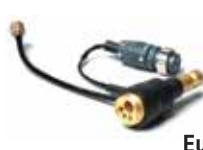
Euro gun adaptor