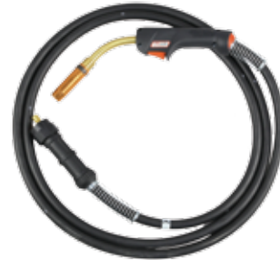
LG air cooled MIG Welding Torch