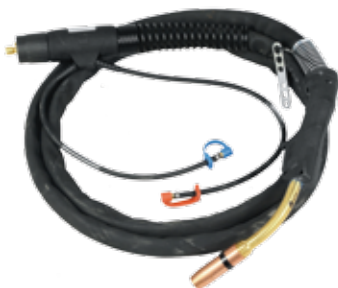
TBI Water cooled MIG Welding Torch